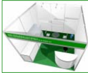
Senior Standard Package