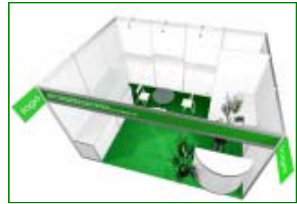
Luxury Standard Package